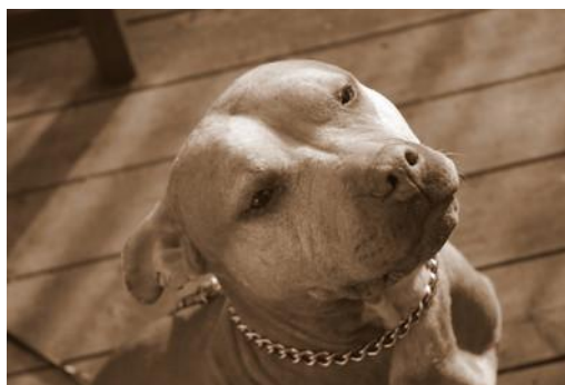
Diamond – In Memory